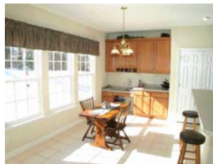
Breakfast Area w/ Built-ins