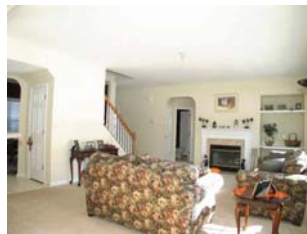
Large Family Room