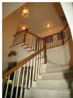
View of Main Stairs from Foyer