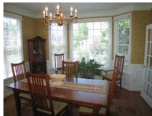
Dining Room w/Bay window