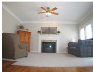
Large Family Room