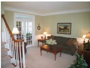
Elegant Living Room

MLS # 758993 Offered at $334,900 4 bedrooms plus bonus room – 2850 sq. ft. Gorgeous drive up appeal & that's just the beginning!