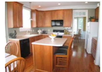
Island kitchen w/many extras