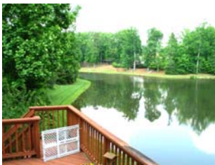
Lake View—Screen Porch

MLS # 803582 Offered at $439,900 Lake Front Living at It's Best