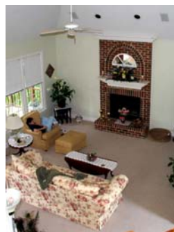
Elegant Vaulted Family Room