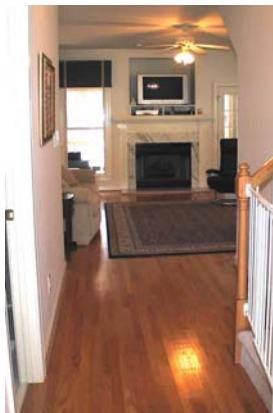
View from Foyer