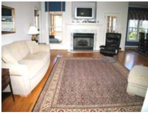
Family Room w/Fireplace Master Bedroom

MLS #844312 OFFERED AT $264,900 Private Cul De Sac Location