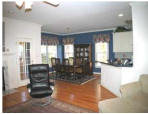
View from Family Room Huge downstairs bedroom