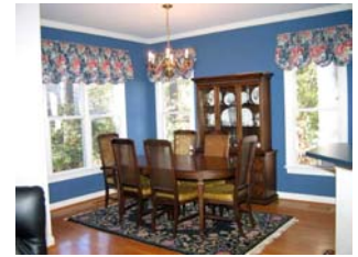
Dining Room Screened Porch!