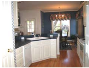
Kitchen and Dining Hall Bath