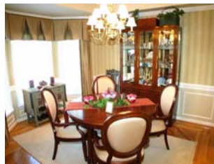
Dining Room w/bay window Gorgeous Master Bath