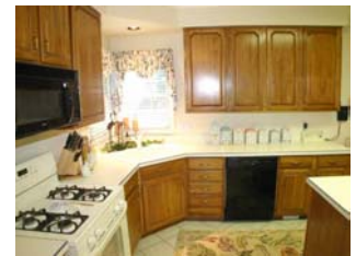
Kitchen w/many upgrades Crawl Space w/concrete floor