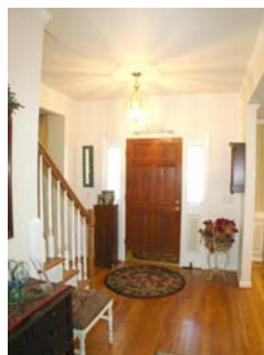
Foyer with hardwood floors