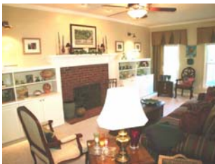
Family Room w/built-ins Breakfast Nook