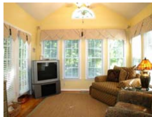
Sun Room w/vaulted ceiling Stunning 2-Tier Deck