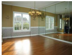
Dining Room w Hardwoods Laundry Room — Wow!