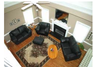
Stunning Family Room 24x18 Bonus Rm with Closet