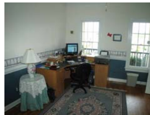
Downstairs Bedroom/Office Master with Vaulted Ceiling