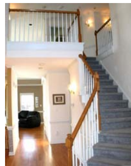
Gorgeous 2 Story Foyer!

Each Office Is Independently Owned And Operated.