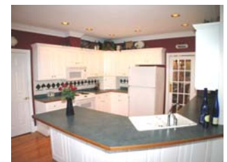
Kitchen with Breakfast Bar View of deck & house in back