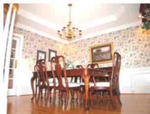
Formal Dining Room Elegant Master Suite