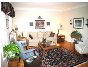
Formal Living Room Breakfast Area

Former Parade Home on 0.48 LOT Deep in the subdivision on a quiet cul-de-sac