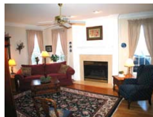
Family Room Lower level bonus/media rm.