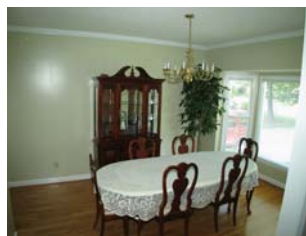
Dining w/ Bay Window Master Bed w/Hardwoods