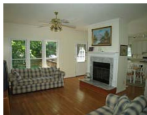
Open Family Room Elegant Master Bath