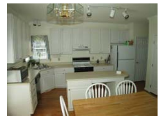
Island Kitchen Large Fenced Backyard